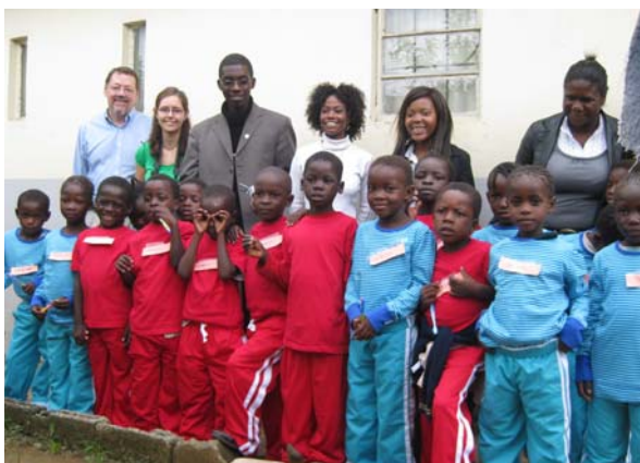
Volunteers from the U.S. and the University of Zambia pose with the Pre-K Class at the Kondwa Day Center for Orphans after sharing Angel gifts!

2008 Holiday Angel Project Highlights: —Delivered gifts of clothing, crayons, school supplies, toothbrushes and toys to more than 115 orphans and vulnerable children —Shared gifts with all ten teachers at the Kondwa Day Center for Orphans