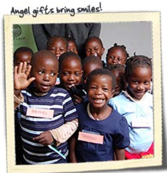
Children at the Kondwa Day Center for Orphans showing off new clothes and toothbrushes!